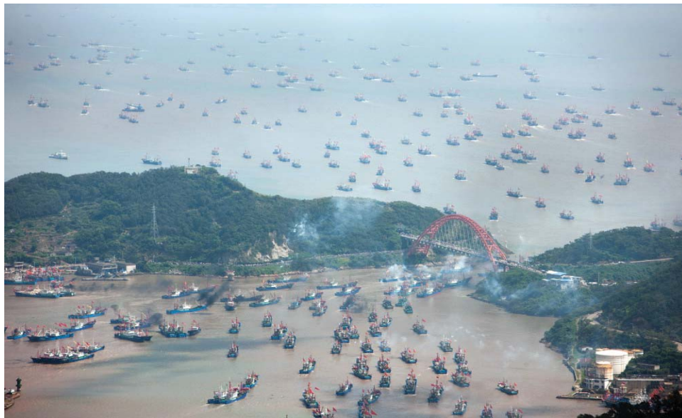
Fishing boats are proceeding to the fishing farms after fishing ban ends

Apart from the fog season in March and April, the period between August and October is another high-occurrence season of collision incident with fishing boats. Viewing the above, ships are suggested to pay more attention in the subsequent days immediately after the fishing season starts.